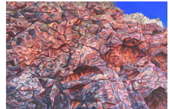
Victoria Wade "Arkaroola Cliff" 103x 74cm painting