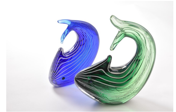
Randall Sach "Fish with cane decoration" 280x150x70cm, glass sculpture